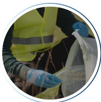
City Cleaning and Rubble Removal