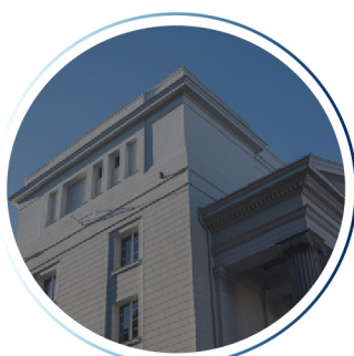
Government Buildings Construction, Maintenance, and Restoration