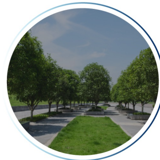
Fountains, Gardens, and Public Park Creations