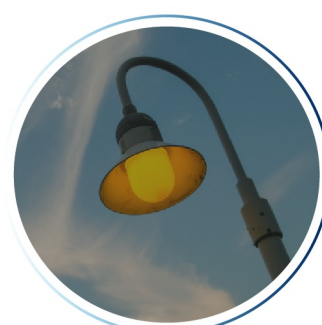
Electrical and Lighting Works