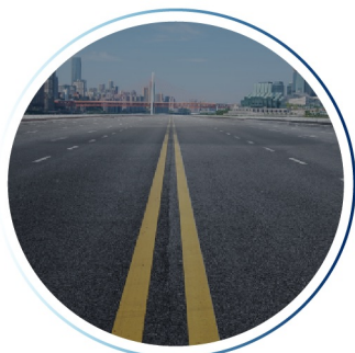
Road Construction and Asphalt Works