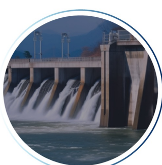
Rainwater Drainage and Removal